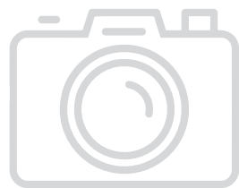
IMAGE COMING SOON

These particulars, whilst believed to be accurate are set out as a general outline only for guidance and do not constitute any part of an offer or contract. Intending purchasers should not rely on them as statements of representation of fact, but must satisfy themselves by inspection or otherwise as to their accuracy. No person in this firms employment has the authority to make or give any representation or warranty in respect of the property.